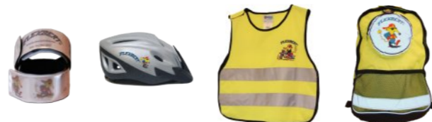
The Reflector The Helmet The Vest The Rucksack

Momenta UK Limited 10 Little Balmer Buckingham Industrial Park BUCKINGHAM MK 18 1TF Phone: 0845 299 0004 Website: www.momenta.se E-mail: info@momenta.se